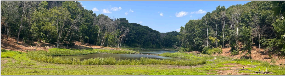
Seidls lake facing north, prior to the restoration work to occur in 2024 and 2025