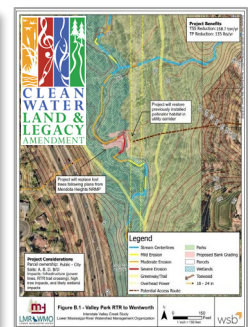
Erosion at IVC and Study Project ID Page