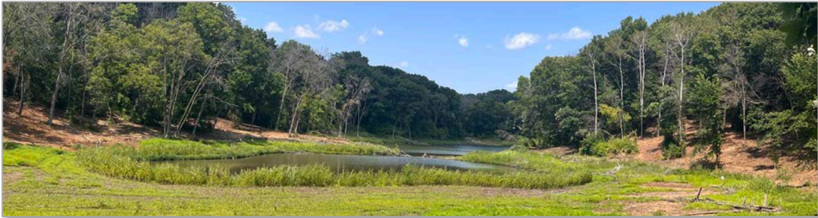
Seidls lake facing north, prior to the restoration work to occur in 2024 and 2025