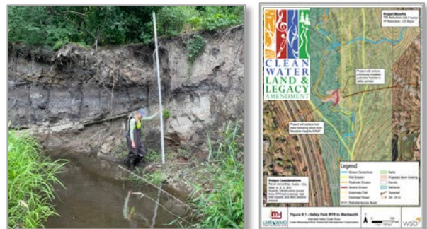
Erosion at IVC and Study Project ID Page